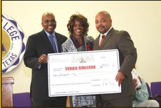
The Kappa Alpha Psi Fraternity, Inc. donates $1,000 to the Texas College general operating fund.