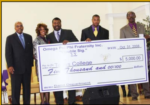
The Omega Psi Phi Fraternity, Inc. presents a $5,000 donation for the Band Department.