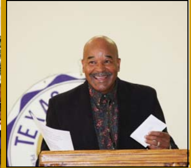
Special community-based organizations also provided support to Texas College.