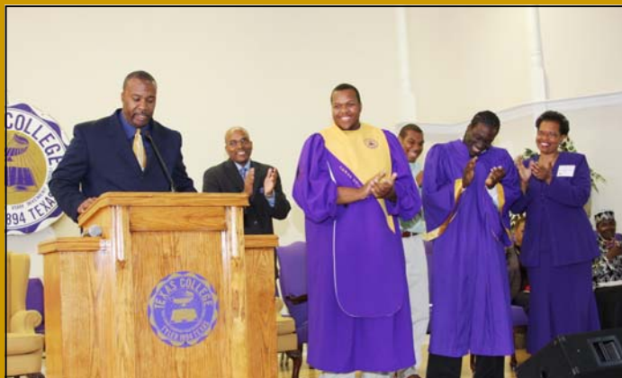
Scholarship donations were given to several Choir Members by the Alpha Phi Alpha Fraternity, Inc.