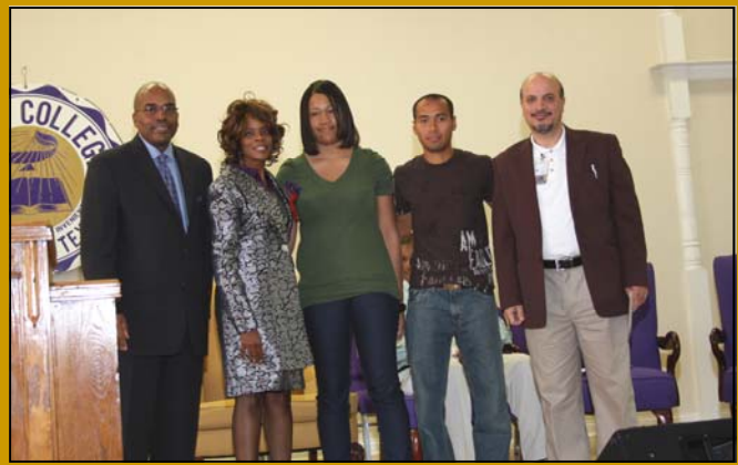
A private donor provided scholarship funds for students in the Division of Business and Social Sciences who have excelled academically.